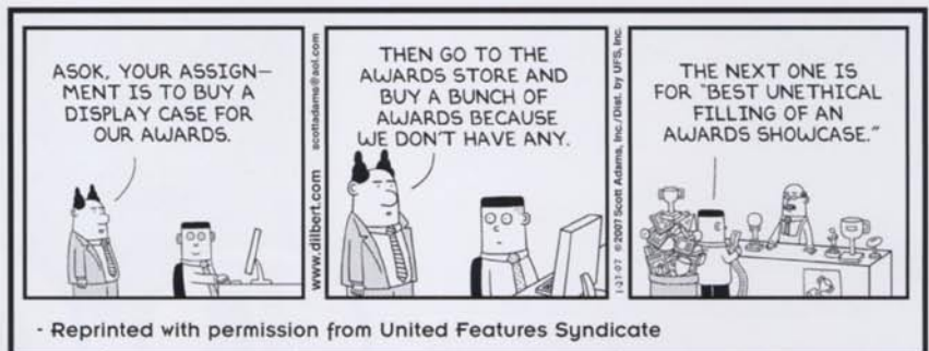
- Reprinted with permission from United Features Syndicate